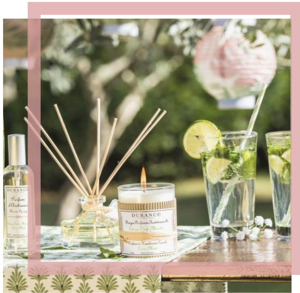
New fragrances in existing collections